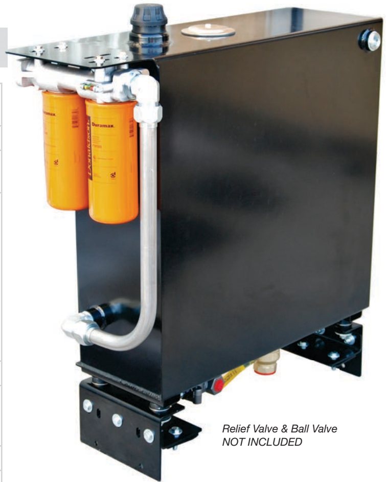
Relief Valve & Ball Valve NOT INCLUDED