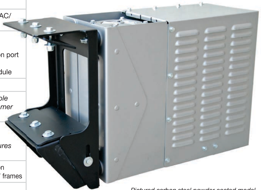
Pictured carbon steel powder coated model with optional no drill quick mount.

Private label available, please inquire.